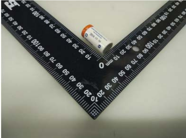
电池/ Battery(CR123A 3,0V 1500mAh)