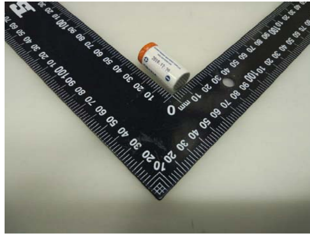
Cell/电芯 (CR123A 3,0V 1500mAh)